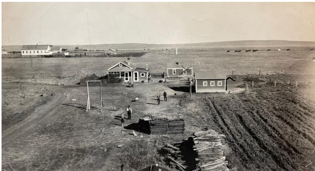
1924 Looking north from Sundgaard's place, notice the school in the background.